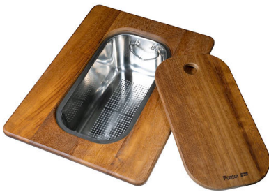
Iroko-wood sliding chopping board with stainless steel colander 8644 044