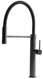
Mixer Tap Skin Gun Metal 8424 856