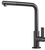
VELA PLUS GUN METAL satin 8498 126